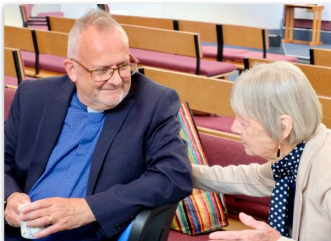
Meeting with the Elders.