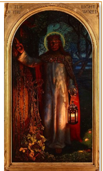
The Light of the World Holman Hunt