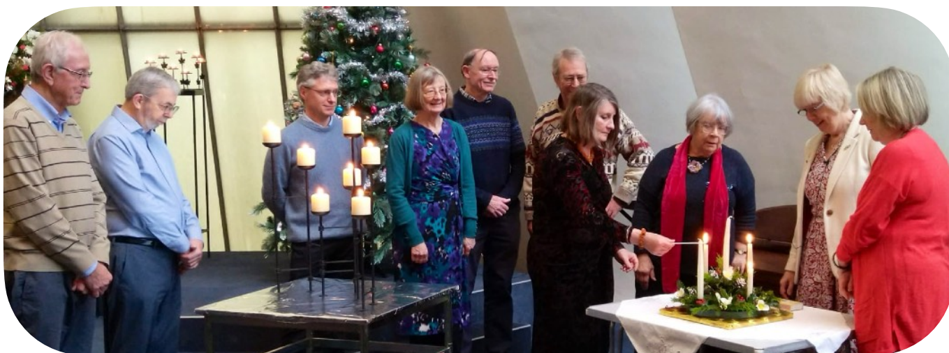
At the Christmas Day service all the Elders were invited to light the candles as a thank you for their support during the year.