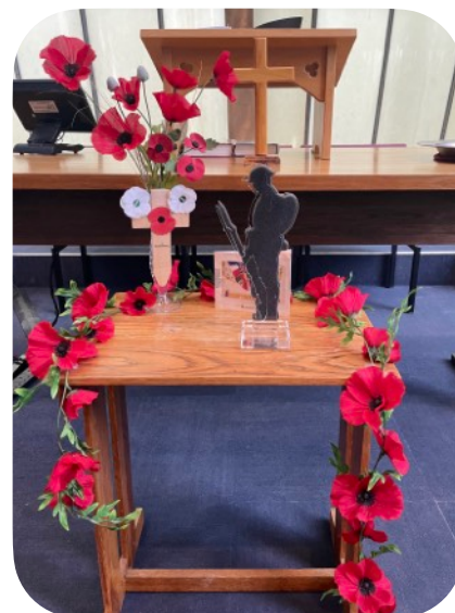
Remembrance Sunday poppy display.