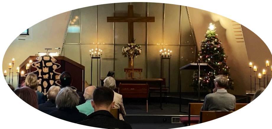
The candlelit Carol Service.