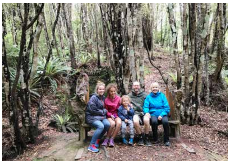
Resting during a walk through native bush

walking up in the ski fields above Queenstown and on New Year's Eve, spent the day rock climbing by Lake Wakatipu. I also achieved a lifetime dream of waterskiing!