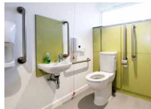
Fully accessible toilet