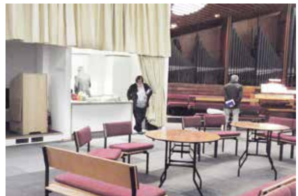
The new cafe-style seating at the rear of the sanctuary