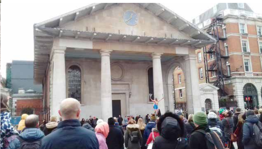
St Paul's is the Actors' church.