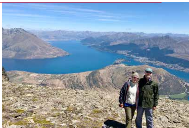
Looking over Queenstown & Lake Wakatipu