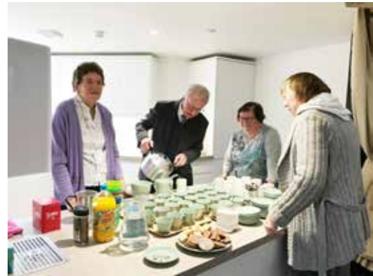
Refreshments being served

“ Due to the generosity, vision and expertise of many, we've succeeded in opening up our building as a community-wide resource and a hub of worship and fellowship.”