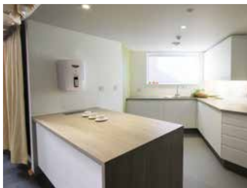
New refreshment-serving area, with hot water supply