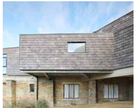
External view of the extension