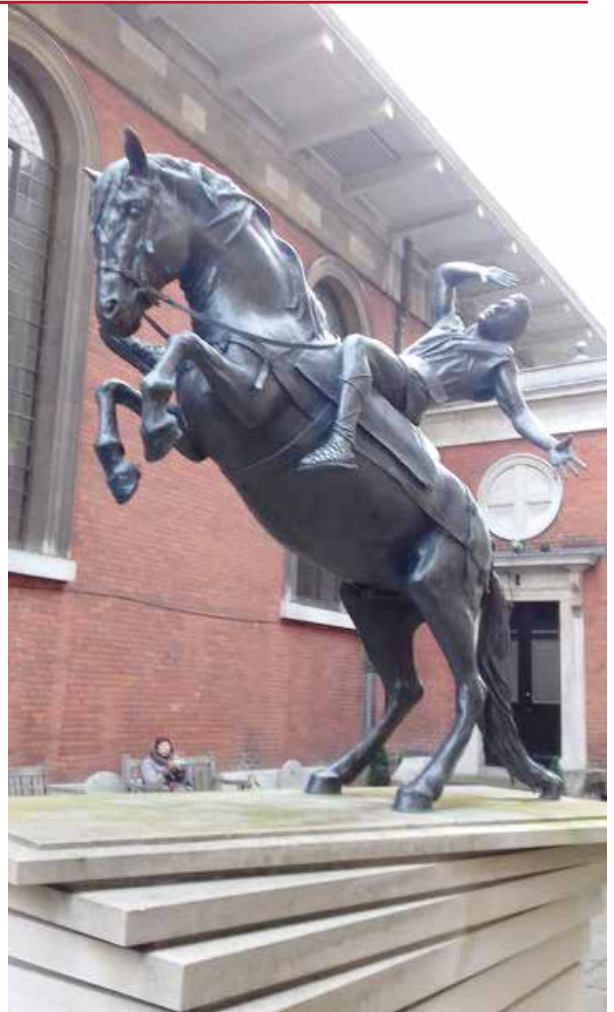
This statue is within the grounds of St Paul's Church, Covent Garden. The rider – Saul of Tarsus – is blinded by the presence of God on the road to Damascus, falls to the ground, and is commissioned by the voice of Jesus.

"Oh yes," she said. "The annual service for them is on the second Sunday in May."